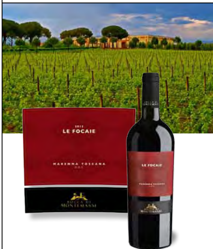
ROCCA DI MONTEMASSI, 2015 LE FOCCAIE, MAREMMA TOSCANA, $72/6 ($18) ★★★★★

Very fine quality and value. A ripe, supple, fairly rich Sangiovese with good balance and flavor (cherry, red currant, toast, rosehips), and a medium long finish. Will be better next year. 100% Sangiovese. Aged 12 months in French oak barrels. 13.5% [2018-2021] Zonin USA, Charlottesville, VA 434.979.6180